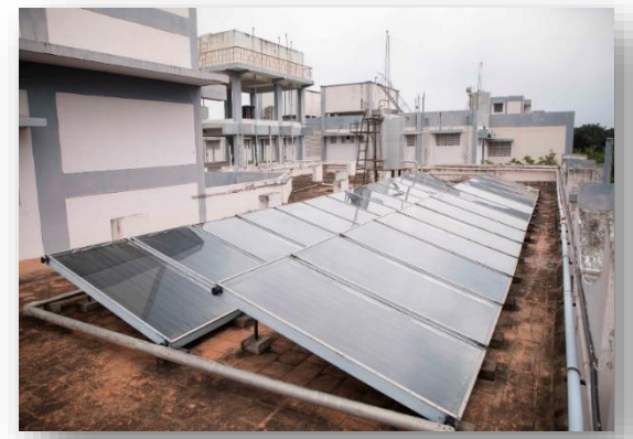
Solar Water Heater- Ladies Hostel 1