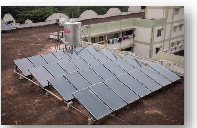
Solar Water Heater – Ladies Hostel 2