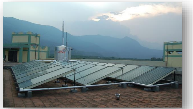
Solar Water Heater- Boys Hostel