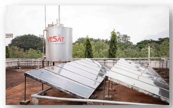
Solar Water Heater- Boys Hostel