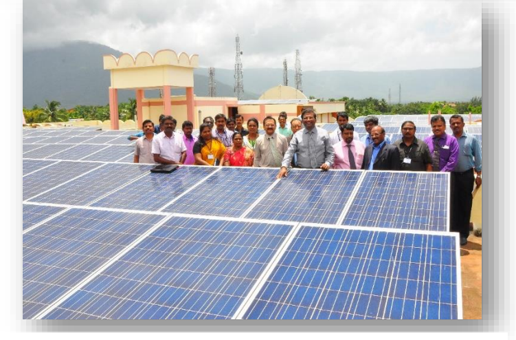
95 kW Grid Tied Solar Power Plant in Administrative Block